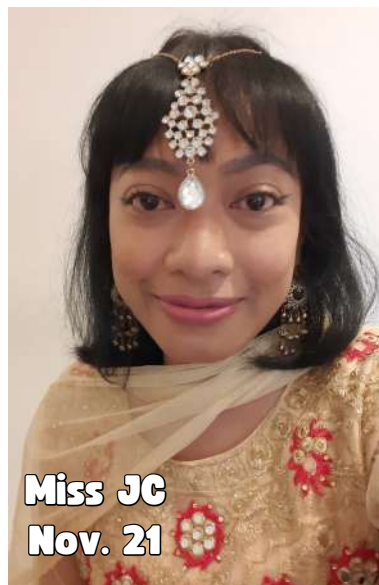
Miss JC Nov. 21